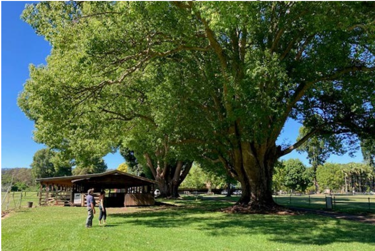
Crown land manager Graziella Garrett and volunteer Ted Greenaway inspecting trees at Bellingen Showground

Crown land managers at Bellingen Showground have used the department's Risk Register, available on the Reserve Manager Portal to help manage dangerous trees. The tool enabled the introduction of new control measures, reducing the risk profile from 'medium' to 'low'. These include: