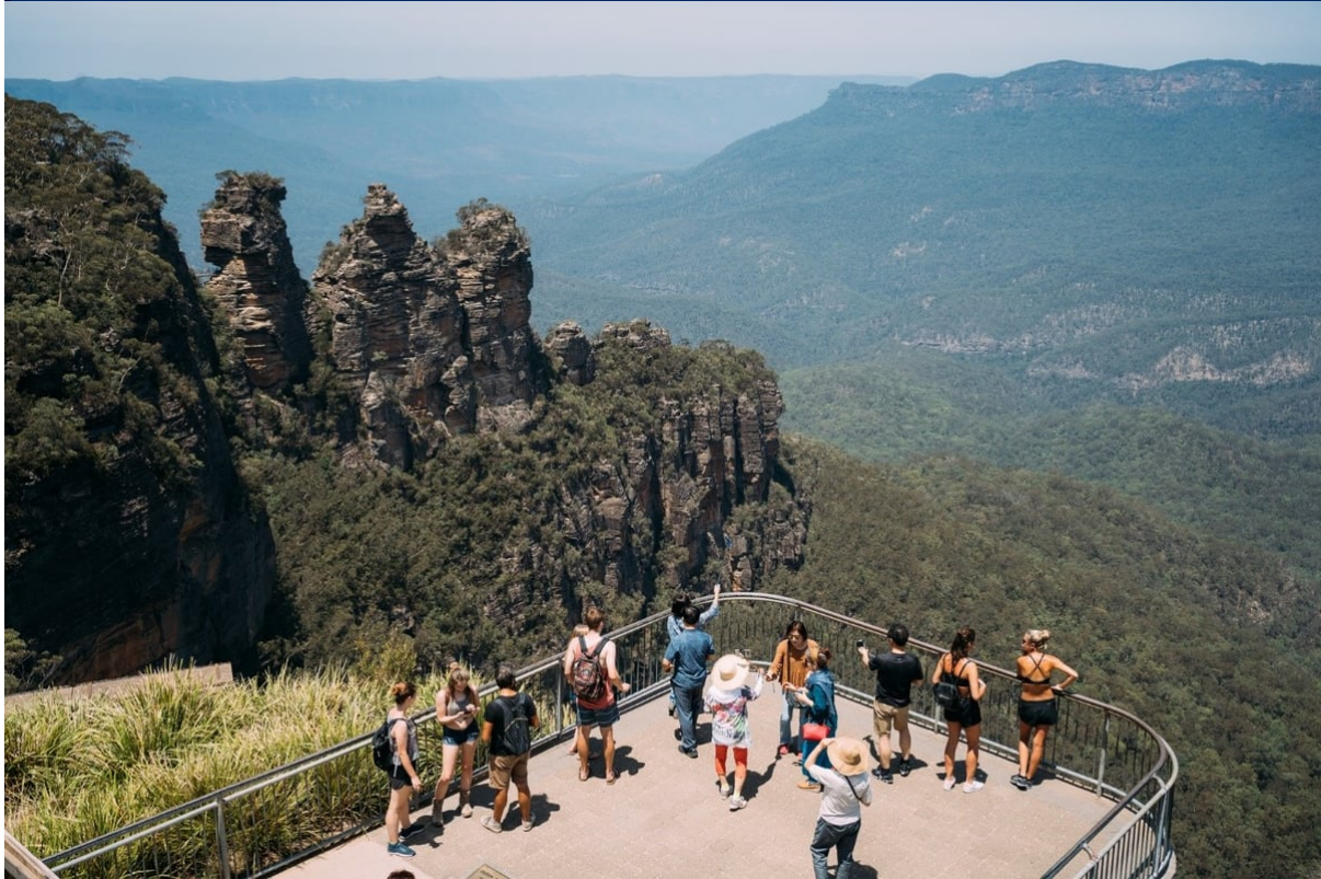
Echo Point Lookout, Katoomba, Blue Mountains, NSW – Dharug and Gundungurra Country