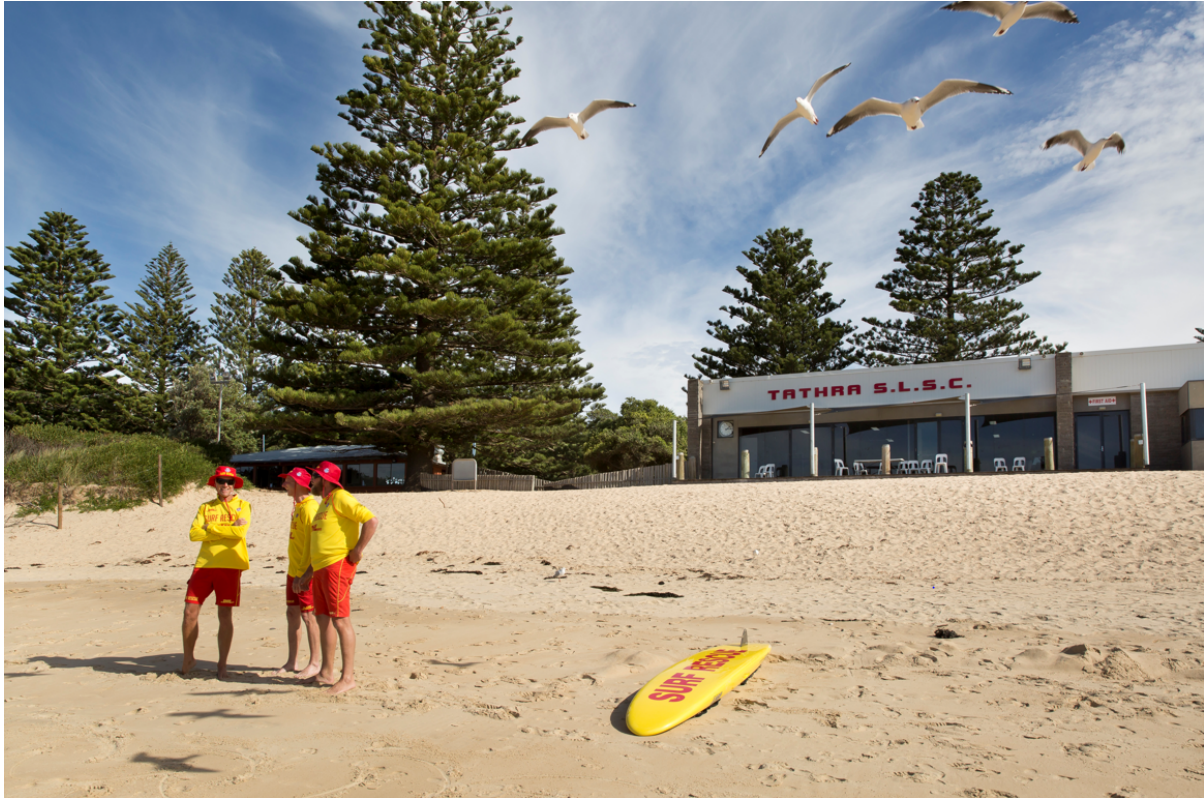
Tathra Surf Life Saving Club, Tathra.

Prior to the adoption of PoMs for Crown land, council Crown land managers can issue some leases and licences, in limited circumstances, as set out in clause 70(2) of the Crown Land Management Regulation 2018 (CLM Regulation).