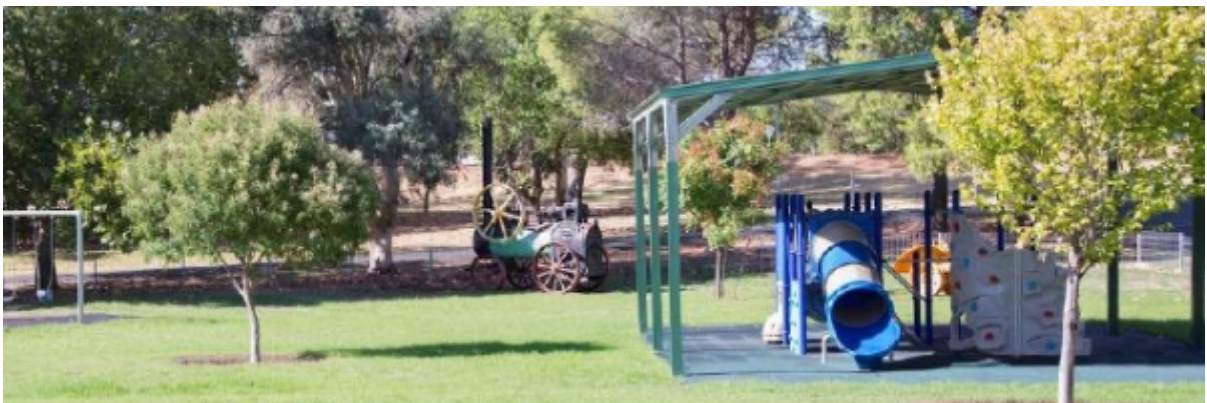
Park on a Crown reserve in Narromine, NSW

Congratulations to Narromine Shire Council who have adopted five Plans of Management (PoM) for all 22 Crown reserves managed by the council. These include two site-specific PoM for Narromine Showground and for Trangie Showground and Racecourse. The council also adopted a generic PoM for Sportsgrounds and Parks and two other generic PoM for reserves categorised as Natural Area and for reserves categorised as General Community Use.