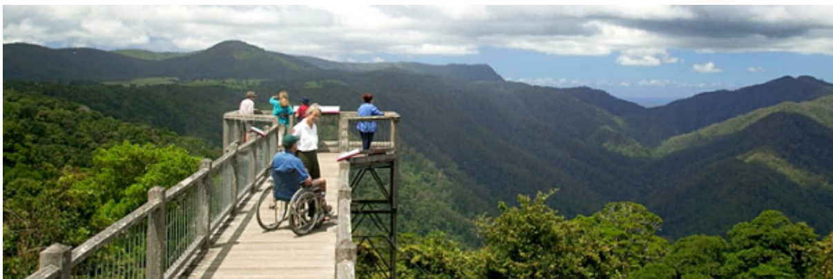
Forest Sky Pier at Niigi Niigi (Sealy Lookout), Coffs Harbour

Applications for the 2021-22 Crown Reserves Improvement Fund (CRIF) closed on 25 June 2021. Thank you to all land managers who submitted applications to this year's program. Applications will now undergo vetting and assessment and funding announcements will be made by the Ministers responsible for Crown Lands by December 2021. Learn more about CRIF.