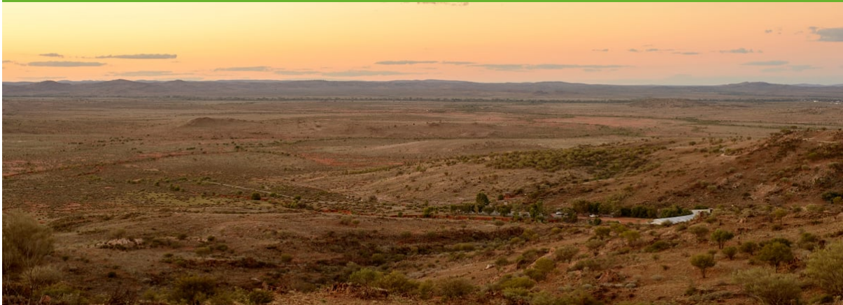
The Living Desert and Sculptures, Broken Hill

The situation regarding the COVID-19 outbreak is changing rapidly, and Crown land managers are reminded to regularly check the NSW Government COVID-19 website to keep updated on all COVID-19 information including current restrictions, case locations, support resources for businesses, vaccinations and more.