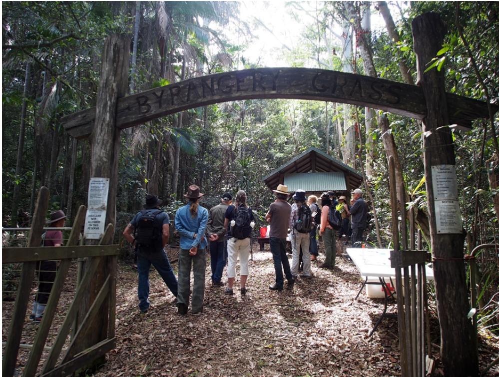
Open day at Byrangery Grass reserve

Byrangery Grass Reserve is a 15-hectare leafy bushland, just a short half-hour drive from Byron Bay. For over 30 years the volunteer managers have followed a simple mantra for bush rehabilitation at site - create the conditions in which the reserve can look after itself!