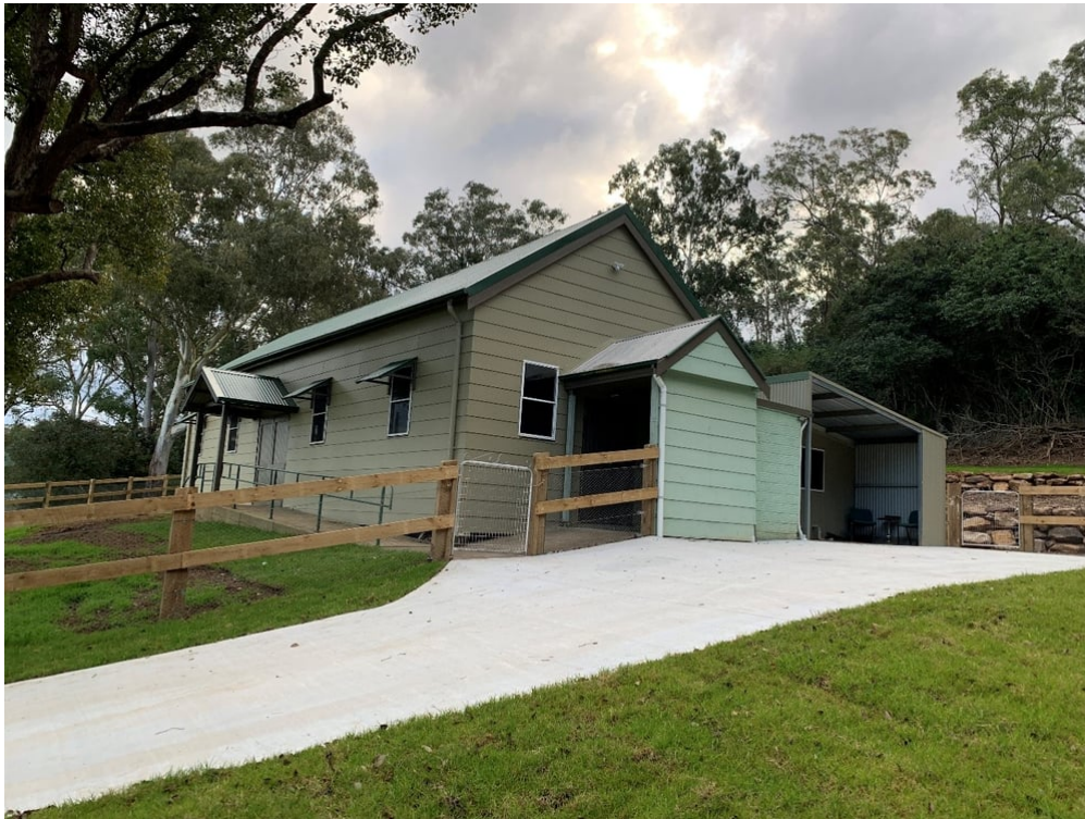
Freemans Reach School of Arts Hall after 2021/22 CRIF upgrades.