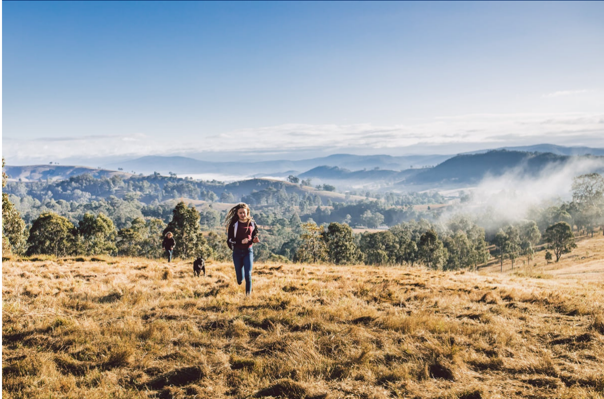
Dungog Common Recreation Reserve – R1038088