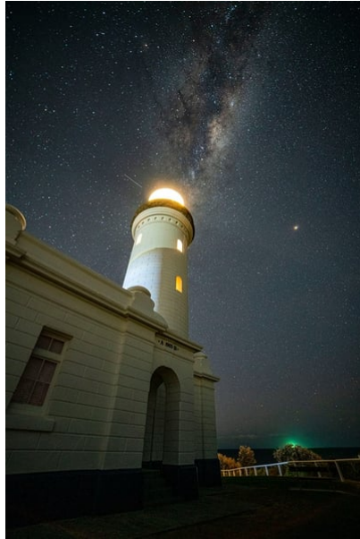
Norah Head Lighthouse - R1003869

Have your say to help improve how we support Crown land managers in their roles. Please complete this short, 5-minute survey to provide your feedback.