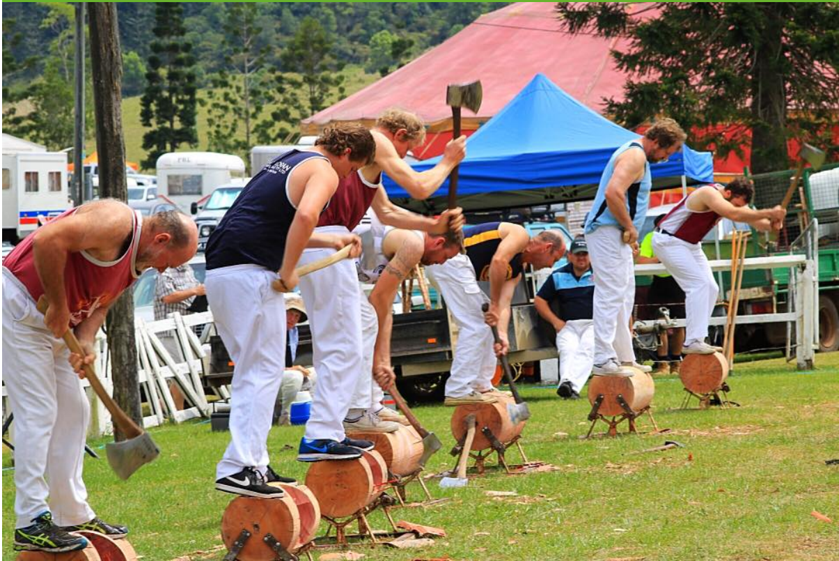
Woodchopping at Lismore Show