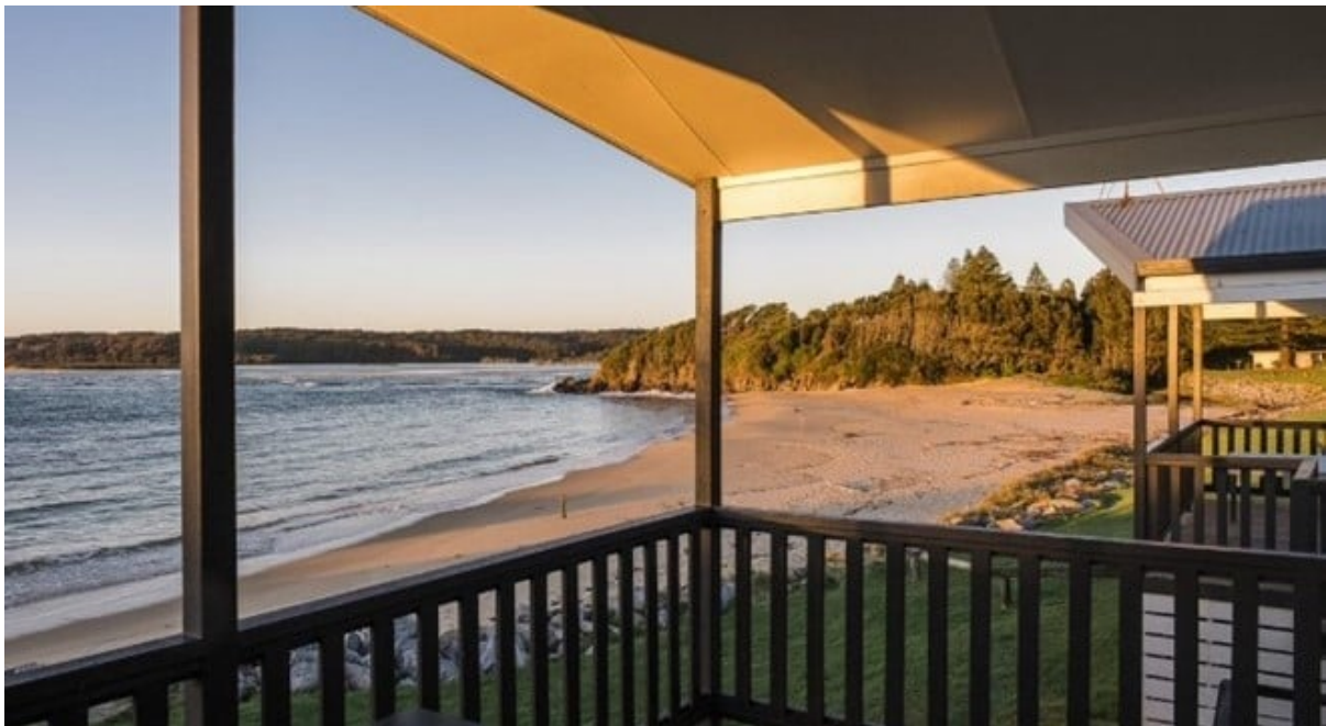
View from Tuross Holiday Park

In June, the department hit the road across NSW to engage with operators of caravan parks on Crown land, to better understand the opportunities that lie within this highly valuable sector. Around half of the Crown caravan park network turned out to have their say and help shape the strategic focus for future initiatives that will support and strengthen the industry.