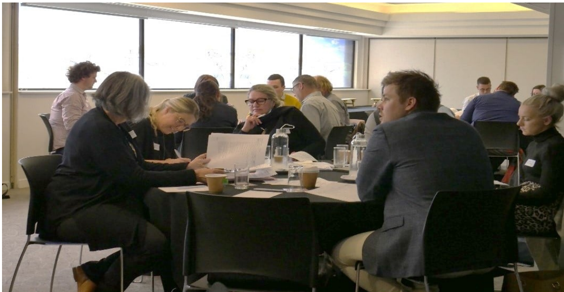
Council staff at Native Title Manager training

The department recently hosted over 50 participants (from 30 councils) at Native Title Manager training in Sydney on 12 and 13 July 2022. The course featured a mix of presentations and activities to provide further context for councils in relation to native title obligations and Plans of Management.