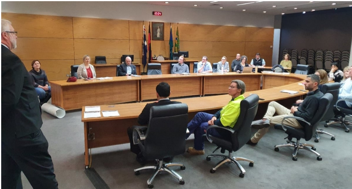
Workshop with 8 councils at Wagga Wagga City Council Chambers

In June, the department met with Central Darling, Broken Hill and Wentworth councils. These workshops focussed on the Barkandji native title determination and how council's decisions on Crown land may impact on the native title rights of the Barkandji People.