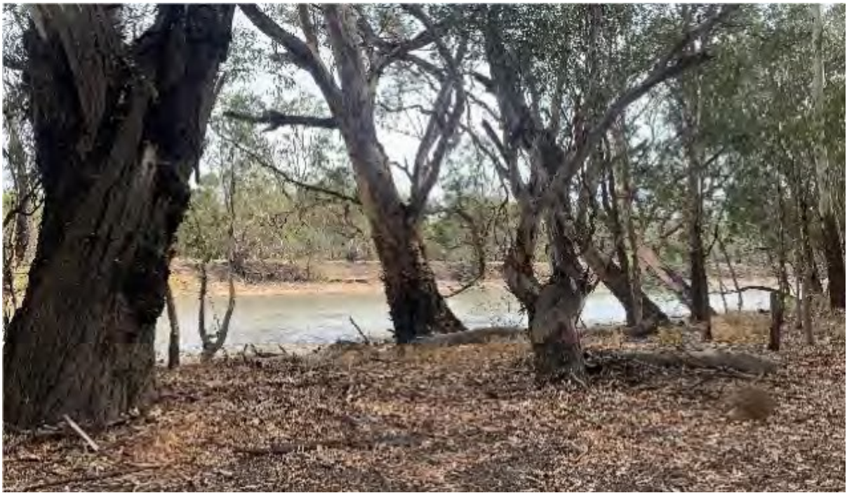
South Hay reserve (R11036) includes natural area bushland on the Murrumbidgee River

To date, 341 Plans of Management (PoM) have been submitted by councils, of these 226 have been assessed by the department and 118 have been finalised and adopted. An example is Hay Shire Council's Generic PoM for all 25 Crown reserves and council-owned community land, which was adopted by council on 28 June 2022 and is available to view on the council's website .