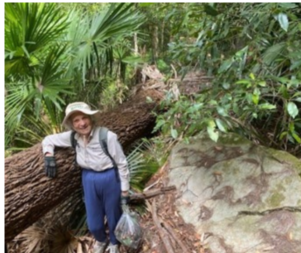
Volunteers are actively involved in managing the reserve at Katandra Bushland Sanctuary

On an escarpment just up the hill from Mona Vale, sits the beautiful 12 hectares of the Katandra Bushland Sanctuary. The sanctuary is almost free of any invasive weeds and features rainforest remnants, creeks meandering through fern-ringed pools, and more than 350 types of flora and fauna.