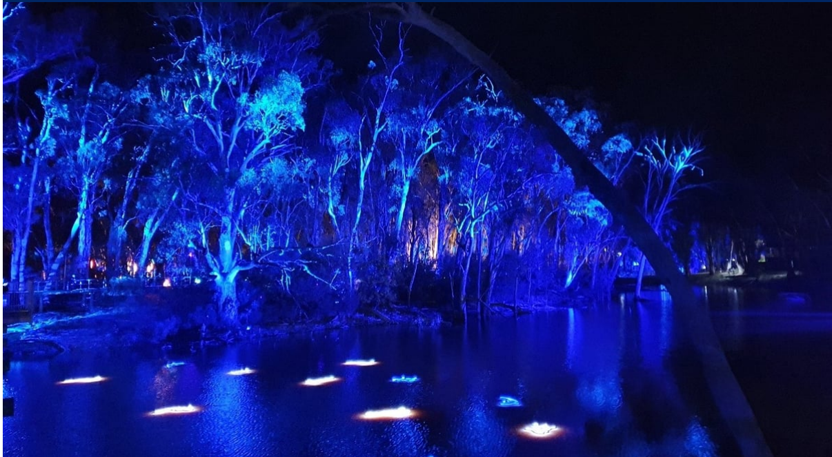
Moama Lights at Horseshoe Lagoon (Crown land) on the Murray River at Moama/Echuca