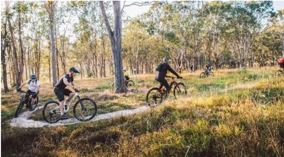
Mountain bike riding on the bike track at Dungog Common NSW

The department's Compliance Strategy and Monitoring team can offer advice about managing the use of the reserve and setting visitor expectations. We can also support you to make sure adequate regulations are in place that promote the appropriate uses of the reserve to ensure compliance is achieved. Information is available on the Reserve Manager website . If you have any queries, contact the team at cl.compliance@crownland.nsw.gov.au .