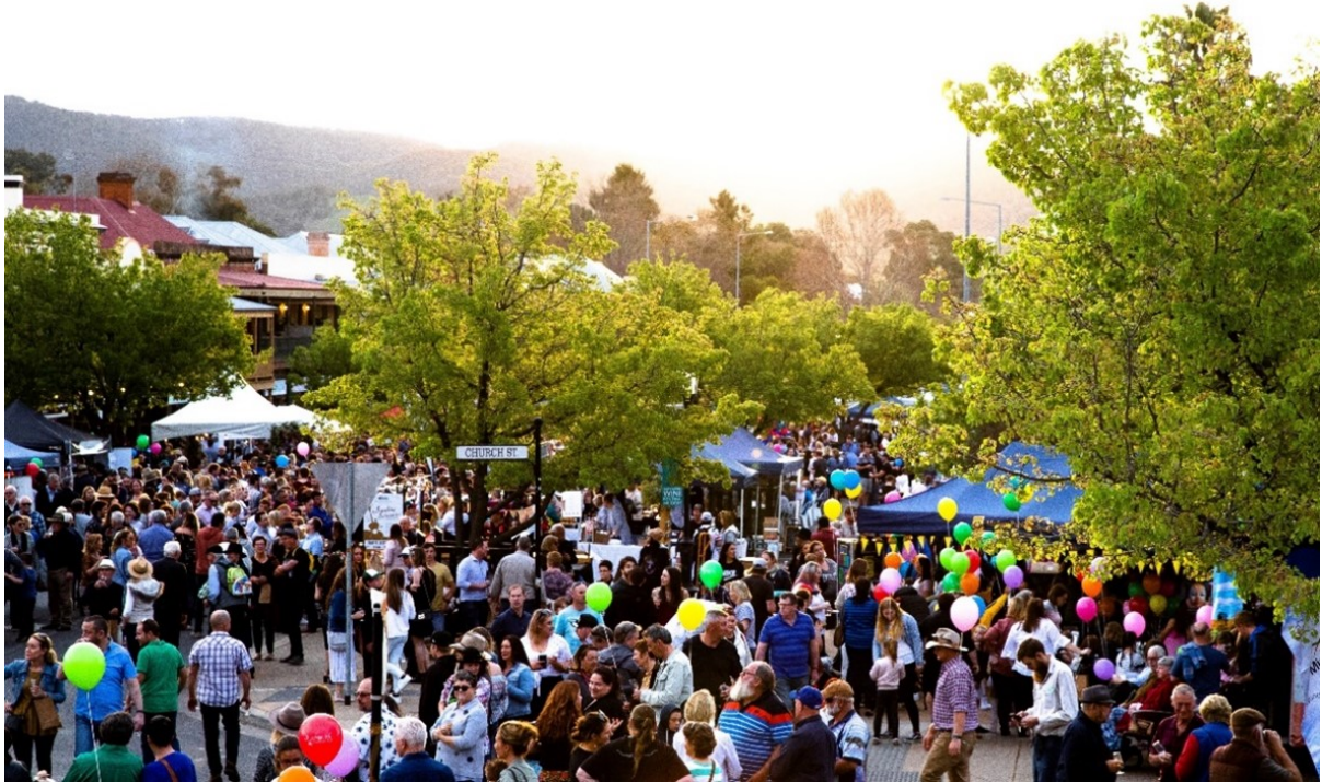
Mudgee Food + Wine Festival

A new $25 million Community Events Program is part of the NSW Government's $200 million Regional Recovery Package, designed to support economic and social recovery across regional NSW that will create new jobs and support community events, shows and festivals to boost tourism.