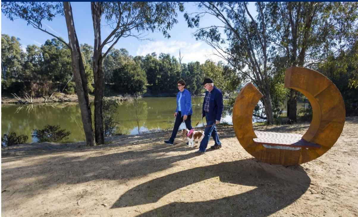
Public art sculpture at Oura Beach Reserve