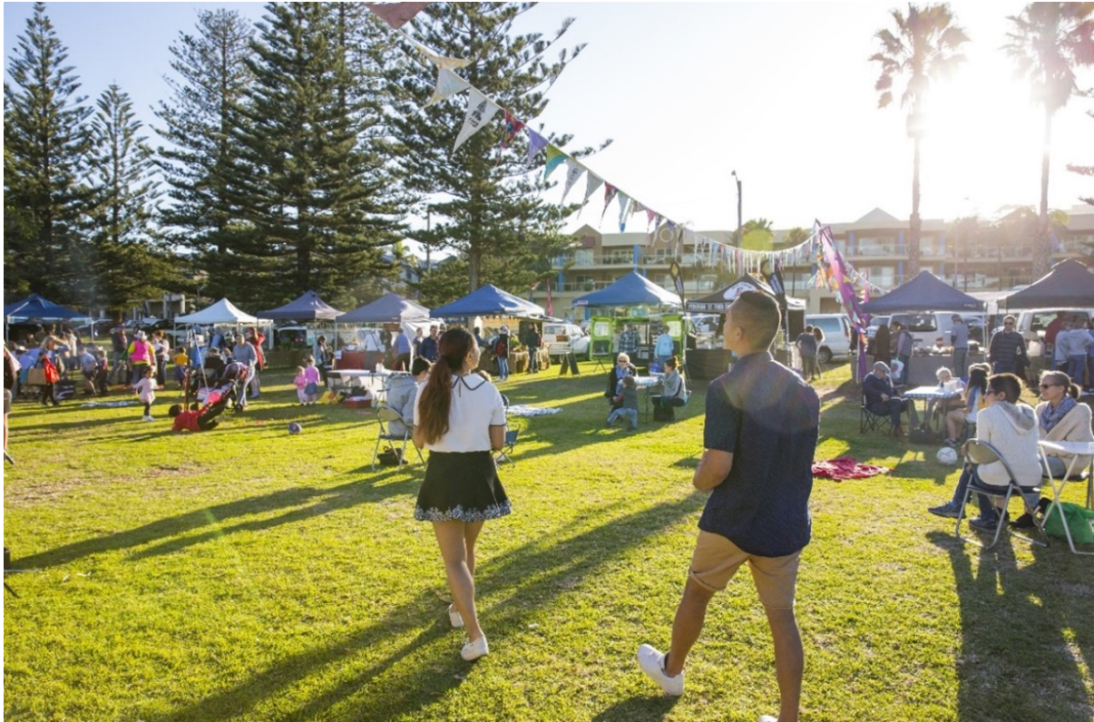
Kiama Farmer's Market

The recently published Crown land 2031 Action Plan is the first in a series of action plans to fully implement NSW's State Strategic Plan for Crown land. Some of the key initiatives of this action plan include: