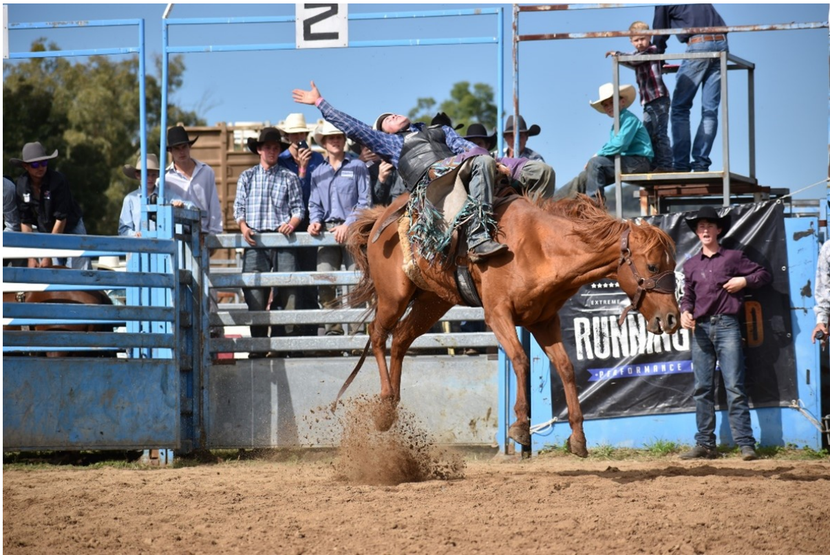
Recent rodeo event, Inverell Showground

Many Crown land managers (CLMs) have experience in applying for funding grants as part of their role managing reserves. Applying for funding in a highly competitive environment, when there are limited funds available, can be a challenging undertaking. But when it's done right, the benefits can be enormous.