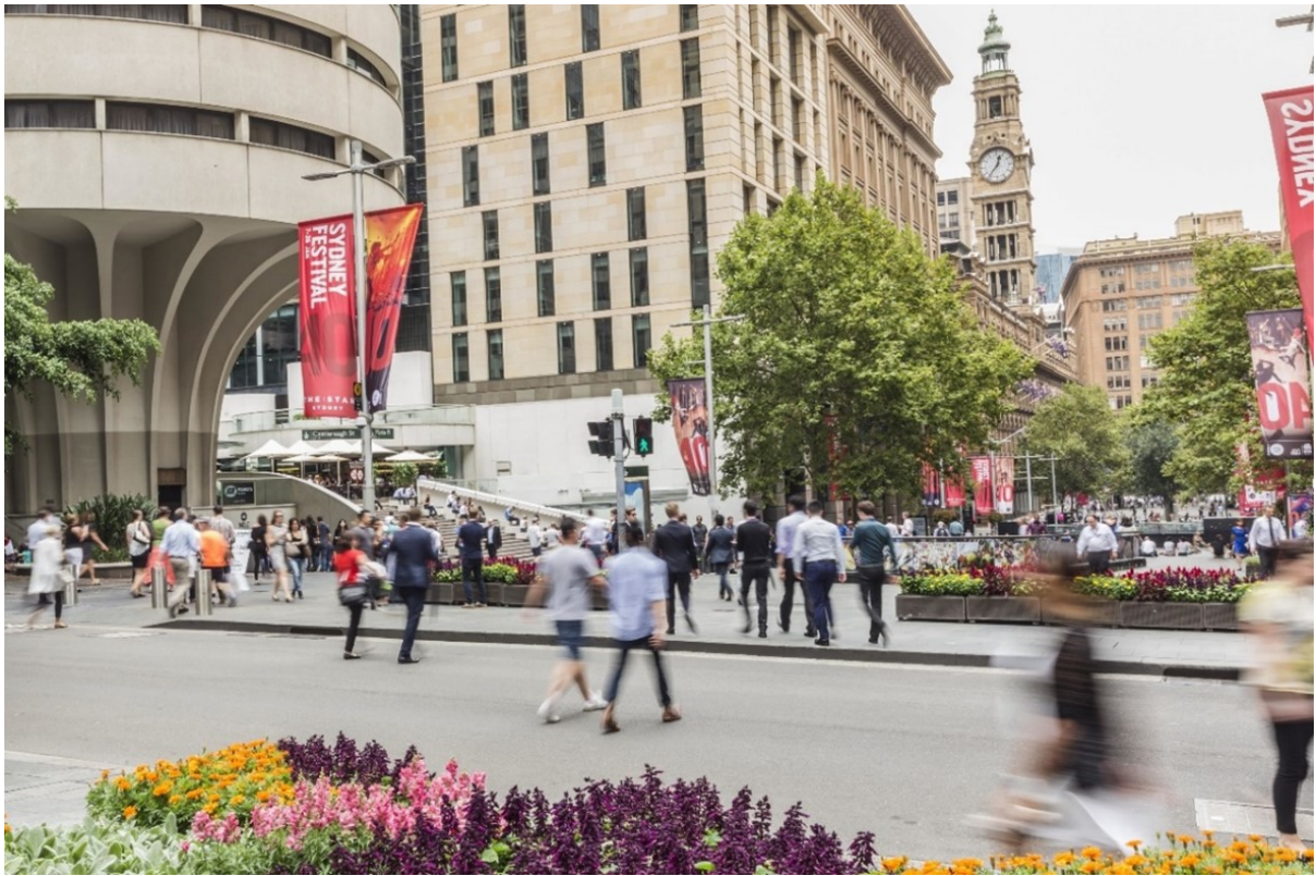
Martin Place, Sydney CBD

City of Sydney, Blue Mountains City Council (BMCC), Griffith City Council and Kyogle Council are just some of the Council Crown Land Managers (CLMs) who recently submitted adopted Plans of Management (PoM).