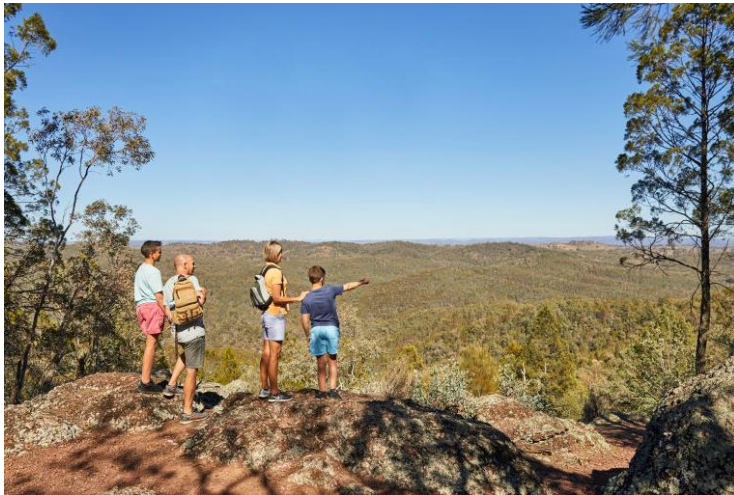
Mount Arthur Reserve Wellington