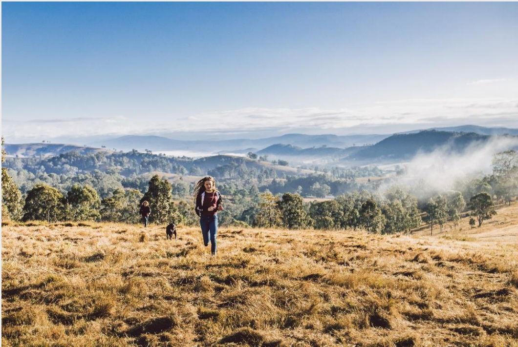
Dungog Common Recreation Reserve – R1038088