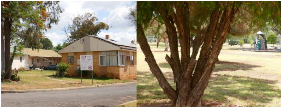
Views of Barnabas House Crisis Accommodation.

Griffith City Council adopted the Community Services Precinct (Kookora & Benerembah Streets) Plan of Management on 24 January 2023, which