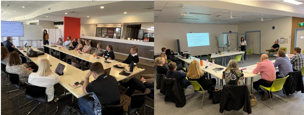
Crown Lands workshops in Goulburn and Queanbeyan

Crown Lands staff were on the road recently running workshops with councils in the Southern Tablelands. The Reserve Programs team and staff from the South-East region's Land and Asset Management team hosted 2 workshops, in Goulburn and Queanbeyan on 14 and 15 November.