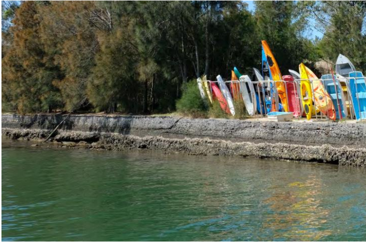
Boat racks on King George Park foreshore, viewed from jetty. (Image: Welsh + Major Architects)

Inner West Council adopted the King George Park Plan of Management (PoM) in November 2022. The council has identified significant areas for improvement and future works for the park, located in Rozelle. The PoM includes the council's site Master Plan, which outlines planned site upgrades. These examples demonstrate how councils can leverage PoMs to authorise future development on Crown land and improve community assets and infrastructure.